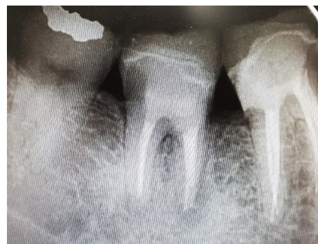
Figure 6. Periapical Radiograph Six Months After Cementation