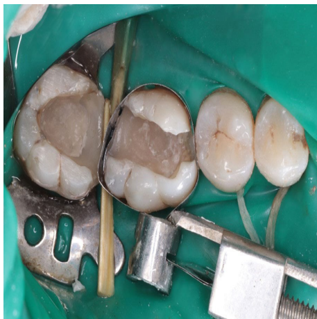
Figure 2. Teeth # 46, 47 After DME Procedure. Note. DEM: Deep margin elevation

(Express 3M ESPE) in a stock tray along with an impression using alginate (Alginoplast EM, Aroma Fine, Coe Alginate, and Jeltrate Plus) for the opposing arch. Lithium disilicate overlays (IPS e.max Press, Ivoclar Vivadent) were fabricated. Before cementation, restorations were examined for fitness and occlusion. A fine-grit football diamond bur (No. 8379 0014, Komet USA, Rock Hill, USA) was used to adjust restorations. We used diamond silicone polishing points (Dialite, Brasseler, USA) for the polishing step. The inner surface of overlays was etched and rinsed with 5% hydrofluoric acid (IPS Ceramic Etching Gel, Ivoclar Vivadent) for 20 seconds. Afterward, 37% phosphoric acid (BISCO Dental Products, USA) was rubbed on the etched area with a microbrush for 30 seconds and rinsed to eliminate porcelain residuum produced after hydrofluoric acid etching. An ultrasonic (Ultrasound Vita-Sonic II, Germany) was used to clean restorations for 5 minutes. After drying with air, a thin layer of silane (silane, Ultradent products) was applied for 1 minute, and a two-step etch and rinse dentin bonding system (Opti Bond Solo Plus, Kerr Corporation) was applied on the inner surface of the restorations and air-thinned. Next, a light protective barrier was placed on the restorations.