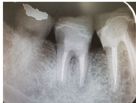
Figure 5. Preapical Radiograph of Teeth #46 and 47 After Overlays Cementation