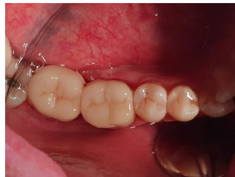
Figure 4. Lithium Disilicate Overlays After Cementation

The build-up of the pulp chamber was performed (1) to follow the fundamental principle of IDS since it increases microtensile bond strength compared with delayed dentin sealing, (2) to block out the undercuts, (3) to achieve an accurate cavity geometry, and (4) to produce an optimal restoration material thickness (12).