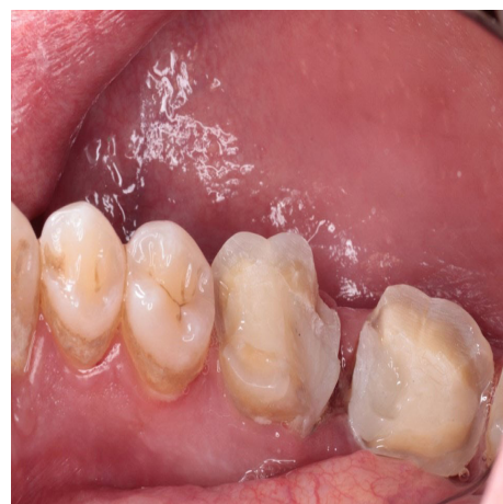
Figure 3. The Cavity Build up With Posterior Resin Composite and in Teeth #46 and 47. Note. The preparation was completed using butt joint preparation in buccal and lingual walls on the enamel surface and slot preparation in the mesial and distal walls in both teeth.