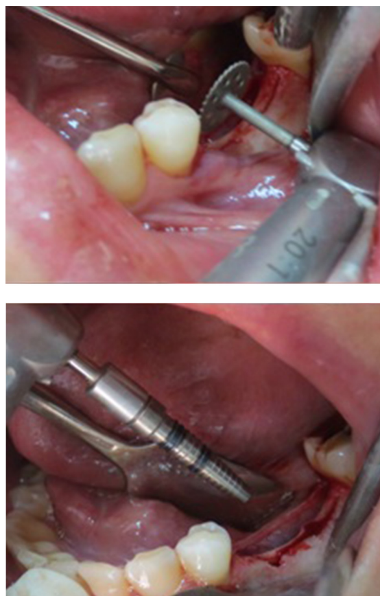
Figure 1. Initial Osteotomy With Separating Disk and Expansion Drill Being Used for Final Osteotomy and Implant Site Preparation