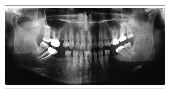
Figure 1. Panoramic View of Patient

In this patient the differentiating the fibrous dysplasia from ossifying fibroma was performed based on the fusiform pattern of expansion, self-limited bony lesion and woven trabecular pattern, present in the fibrous dysplasia (2). Hart et al. found that lesions in the craniofacial region were established earliest. Our patient had a low grade type of the lesion that started from the craniofacial region and stopped quickly, therefore the lesion could not be detected in clinical examinations. They also mentioned that late appearance of new lesions is not common in patients with FD. Due to the asymptomatic growth of the lesion in our patient, the diagnosis was made later. (7). Xavier et al. (2) reported a similar lesion in the mandibular region, in a middle aged woman, although there was no expansion in the case of our patient's and this is a rare finding. This shows the importance of both clinical and radiographic examinations. Bone fibrous dysplasia occurs in association with hyper pigmented skin lesions (1). In the case presented here, fibrous dysplasia and cafe-au-lait pigmentation were both on the left side of the patient's face, whereas Laditan (8) reported swelling of