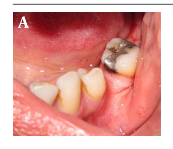
Figure 3. Biopsy Procedure