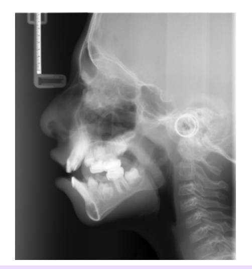
Figure 5. Lateral Cephalometric Analysis Indicated Skeletal Open Bite.

Enamel deficiency makes teeth extremely sensitive to thermal and contact stimuli. Composite resin restorations are a solution to this problem as they protect the remaining structure. After the restoration of all teeth with a direct