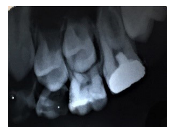
Figure 4. Partial Pulpotomy of Maxillary Left Molar Using Biodentine.

AI is a dental anomaly comprising of hereditary disorders that influence the quality and/or quantity of the enamel (17). AI management could be disputing because of enamel fragility, extended pulp horns, and pulp chambers in children and young adults and severe tooth sensitivity.