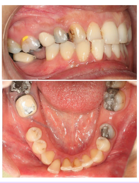
Figure 1. Occlusal and Lateral View of the Subluxated Tooth.

The primary objective of our treatment was to eliminate the