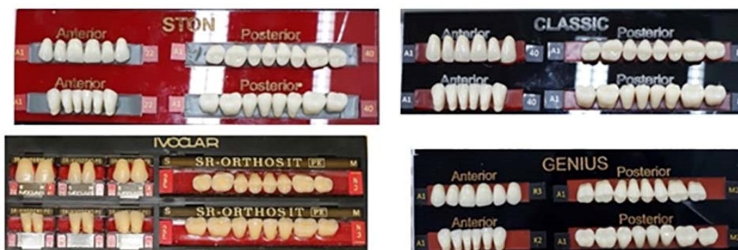
Figure1. Artificial Teeth STON, CLASSIC, IVOCLAR, and GENIUS.