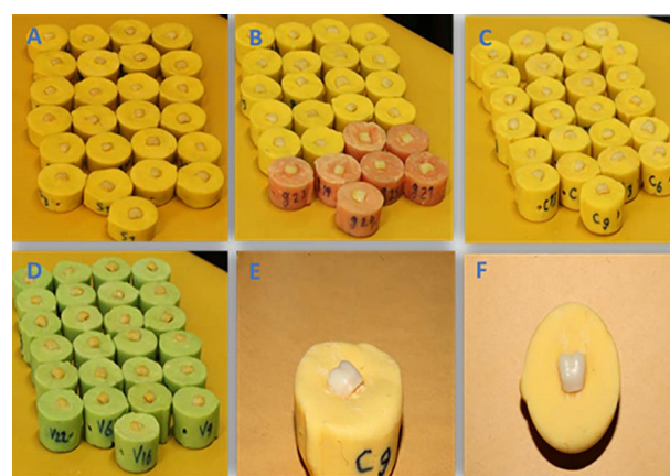
Figure 2. Mounted Specimens: A: STON, B: GENIUS, C: CLASSIC, and D: IVOCLAR.

Comparison between the mean wear of each teeth group