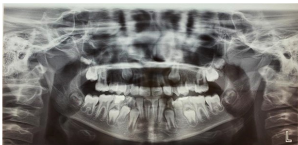
Figure 3. Panoramic View.

During child growth, tooth eruption is an important occurrence and significant deviations from accepted eruption cycle norms are frequently found, which is a source of concern to parents. Dental maturation and eruption through the influence of endocrine advancement are not advanced to the same degree as other biological maturation indicators. In sexual and osseous maturation, normal children who are advanced or retarded are advanced or dentally retarded, though to a less pronounced degree (15). A typical finding is variance in the regular eruption of teeth, but substantial variations from existing standards