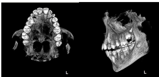
Figure 4. CBCT 3D View.