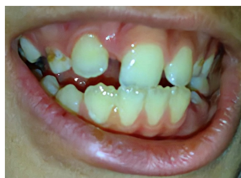
Figure 1. Oblique Close up Smile Photography.

Trauma during odontogenesis stages may seriously affect the morphogenic development of the teeth. Partial