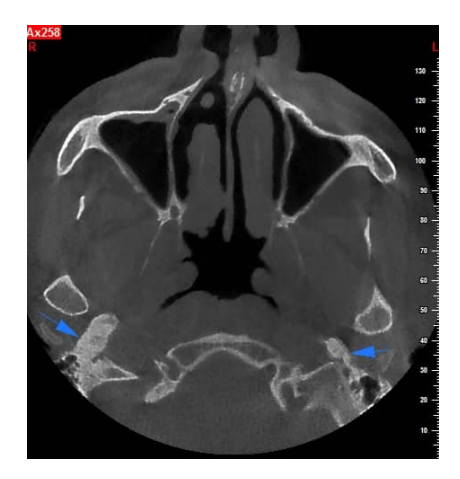
Figure 2. CBCT Radiography. Note . CBCT: Cone beam computed tomography.