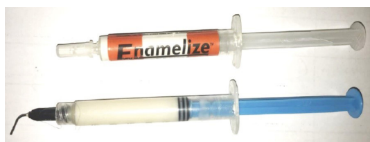
Figure 1. Manufactured and Enamelize Polishing Pastes