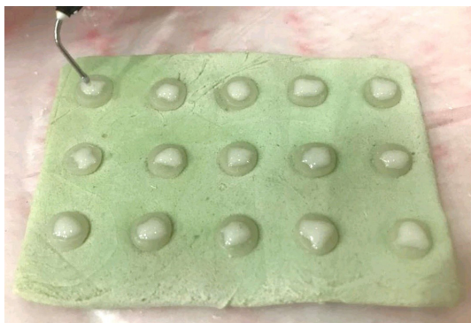
Figure 2. Applying the Polishing Pastes to the Samples

samples. Across all three groups, polishing with the manufactured paste led to lower roughness values compared to the Enamelize paste.