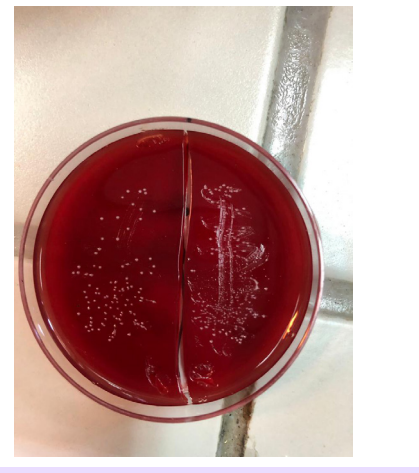
Figure 1. An Image of the Plate With Colonies Grown on Agar