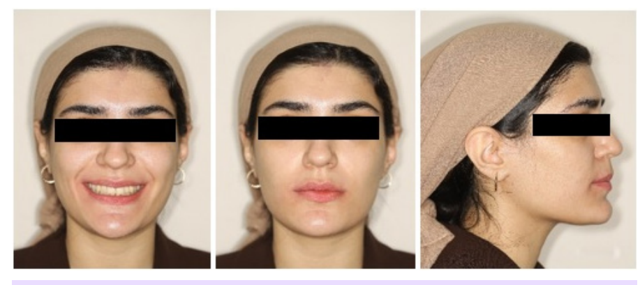
Figure 5. Extraoral Photographs at the End of Treatment.

The findings of the present paper support those of earlier studies, indicating that corticotomy therapy plus