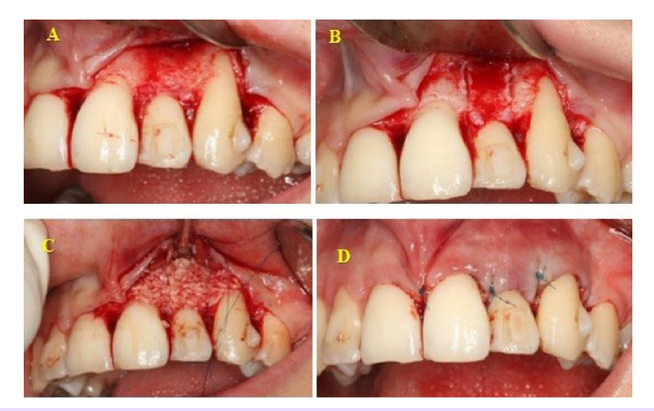
Figure 4. Corticotomy Procedure: (A) Flap Elevation, (B) Corticotomy, (C) Bone Substitute and Absorbable Collagen Membrane, and (D) Suturing With Monofilament Non-absorbable.