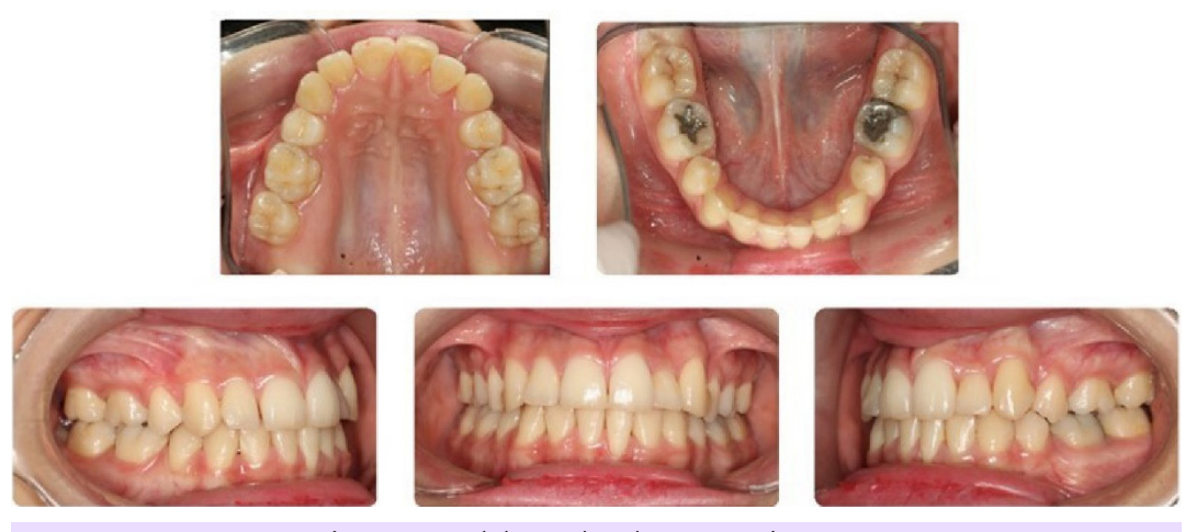
Figures 2. Intraoral Photographs at the Beginning of Treatment.