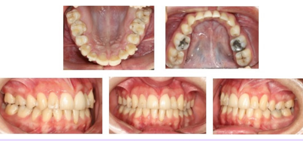
Figures 6. Intraoral Photographs at the End of Treatment.