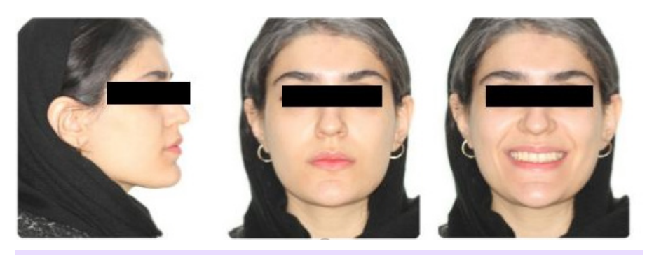
Figure 1. Extraoral Photographs at the Beginning of Treatment.

A 23-year-old female patient was treated with fixed orthodontic treatment by four quadrant premolar extraction, and re-treatment was sought in terms of relapse in upper incisors due to loss of the retainer in Hamadan University of Medical Sciences, Hamadan, Iran. She had no medical problems. She had excellent oral hygiene and no cavities in dental records. Without any temporomandibular joint issues, the patient's oral function was normal. In the maxillary segment, she had a diastema between her incisors and labial frenum. Her profile was symmetrical and straight (Figure 1). A cl II dental occlusion was found after an intraoral examination on both sides, with a slight irregularity in the top anterior section. Upper laterals had an inadequate inclination in terms of their previous palatal position (Figure 2). Moreover, they showed bone loss and root kissing with their proximal centrals in the panoramic view (Figure 3). Panoramic radiograph illustrated the existing upper third molar and semi-impaction of lower ones. The cephalometric analysis demonstrated skeletal class I malocclusion with a decreased overbite.