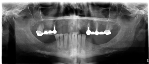
Figure 1. Panoramic Radiograph of the Patient

A #8 K file (Dentsply Maillefer, Ballaigues, Switzerland)