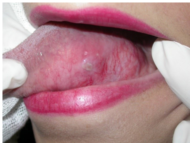
Figure 1. A Small Aphthous Like Ulcer in Left Lateral Border of Tongue.

the specimens revealed a vascular tumor with lobular architecture. Connective tissue showed numerous capillary-sized vessels lined by plump endothelial cells extending between skeletal muscles (Figures 2 and 3). Some of the vessels were filled with RBCs. The lesion was covered by parakeratinized stratified squamous epithelium with acanthosis. Therefore, given the clinical and histological results, the patient was diagnosed with capillary hemangioma. This patient did not attend for follow-up examinations after the confirmation of the diagnosis.