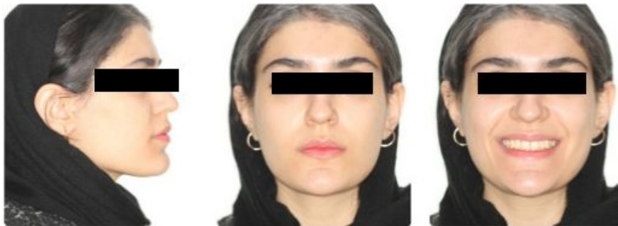
Figure 1. Extraoral Photographs at the Beginning of Treatment.

A 23-year-old female patient was treated with fixed orthodontic treatment by four quadrant premolar extraction, and re-treatment was sought in terms of relapse in upper incisors due to loss of the retainer in Hamadan University of Medical Sciences, Hamadan, Iran. She had no medical problems. She had excellent oral hygiene and no cavities in dental records. Without any temporomandibular joint issues, the patient's oral function was normal. In the maxillary segment, she had a diastema between her incisors and labial frenum. Her profile was symmetrical and straight (Figure 1). A cl II dental occlusion was found after an intraoral examination on both sides, with a slight irregularity in the top anterior section. Upper laterals had an inadequate inclination in terms of their previous palatal position (Figure 2). Moreover, they showed bone loss and root kissing with their proximal centrals in the panoramic view (Figure 3). Panoramic radiograph illustrated the existing upper third molar and semi-impaction of lower ones. The cephalometric analysis demonstrated skeletal class I malocclusion with a decreased overbite.