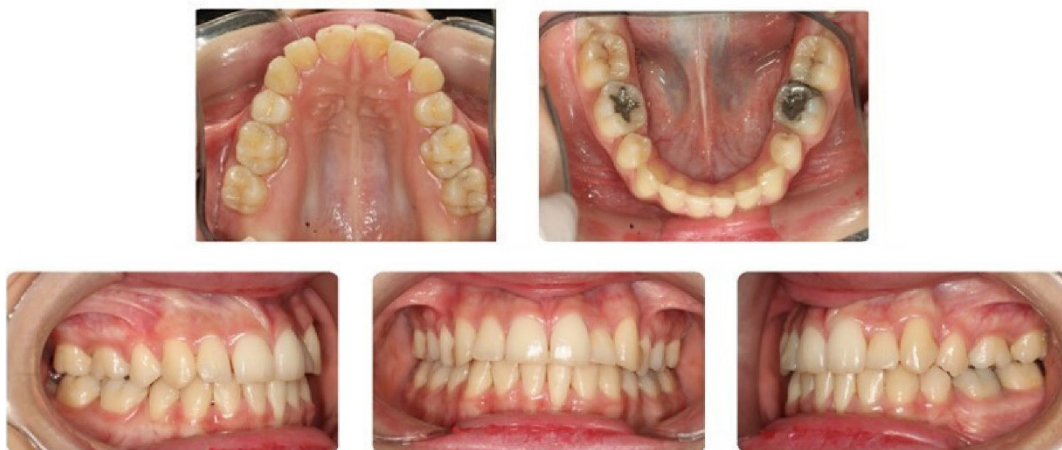
Figures 2. Intraoral Photographs at the Beginning of Treatment.