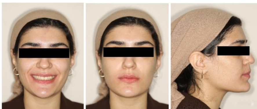
Figure 5. Extraoral Photographs at the End of Treatment.

The findings of the present paper support those of earlier studies, indicating that corticotomy therapy plus