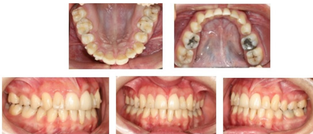
Figures 6. Intraoral Photographs at the End of Treatment.