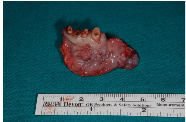
Figure 2. Pretreatment Panoramic View

Direct closure was achieved by direct suturing of the flap. Both intraoperative and then definitive histological examination of the removed section revealed a squamous cell carcinoma G1, T1, N0 with negative margins, no bone