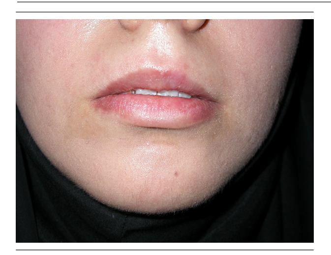
Figure 2. Significant Improvement After Three Months Follow-up