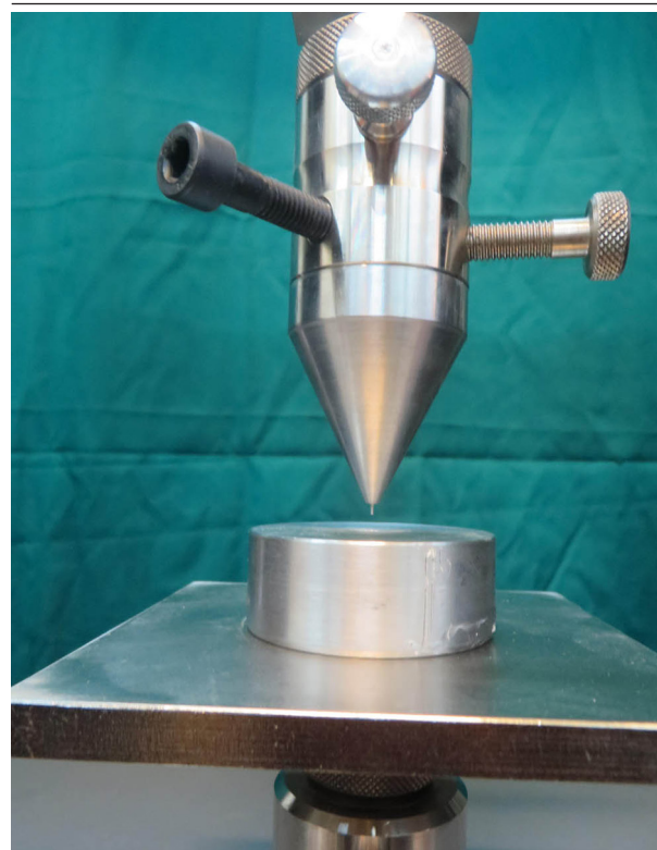
Figure 1. Cylindrical Stainless Steel Plunger Attached to the Load cell of the Universal Testing Machine

The mean push-out bond strength and standard deviations of the four experimental groups were shown in Table 1. Kruskal-Wallis test showed that there were no