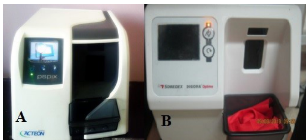
Figure 2. (A) Acteon and (B) Digora Scanners Used in the Two Main Groups of the Study

were processed immediately with the appropriate scanner (the gold standard) 5, 10, 20, 30, 40, and 60 minutes after exposure, resulting in seven scan times for each subgroup and a total of 42 images.