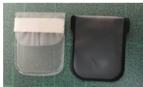
Figure 3. (A) Light Protected Box and (B) Industry Supplier's Semi-transparent Case and Original Dark Case

Today, digital radiology is widely used in dentistry due to its technological advancement (14). Considering the benefits of digital imaging, the replacement of conventional radiography with the digital imaging system even with a diagnostic accuracy similar to that of conventional