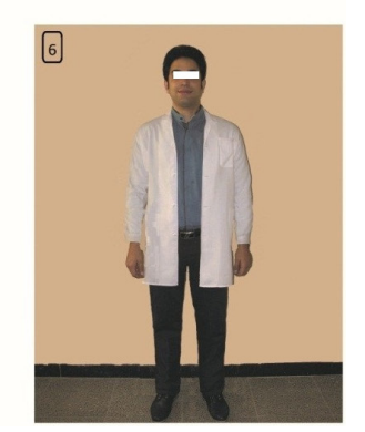
Figure 1. Male Dress Styles.