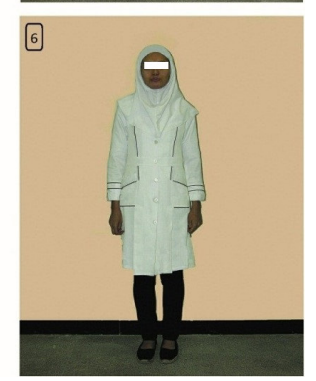
Figure 2. Female Dress Styles.

coat with either a white or black headdress, a waist length coat with either a colored scarf or a black headdress, and a knee length coat with colored strip patterns and a white headdress).