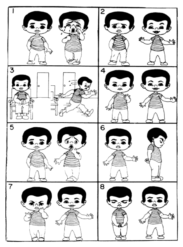
Figure 1. Venham Picture Test.

As explained earlier, various statistical tests were utilized based on the nature of variables. The types of these tests are presented as well. Based on the results, having an experience of dental treatment was the only variable with a significant association with the MCDAS score.