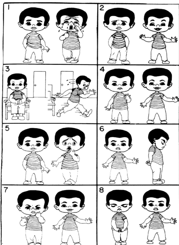
Figure 1. Venham Picture Test.

As explained earlier, various statistical tests were utilized based on the nature of variables. The types of these tests are presented as well. Based on the results, having an experience of dental treatment was the only variable with a significant association with the MCDAS score.